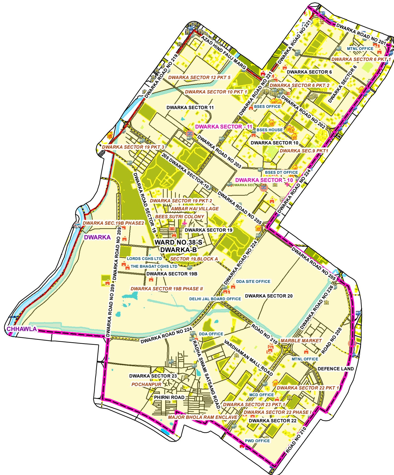
WARDS AS SEEN WITHIN AC- 38 (MATIALA)